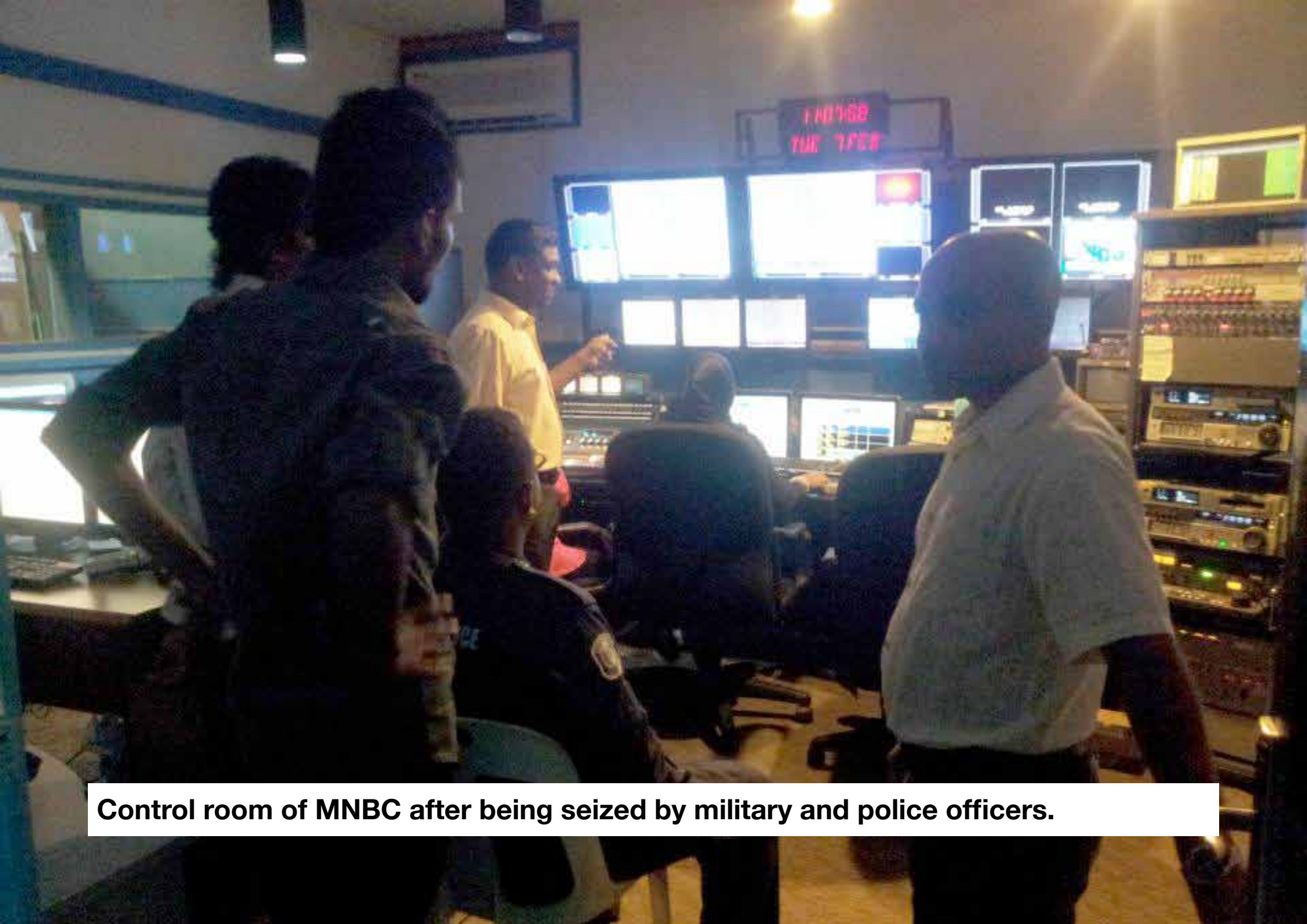
Control room of MNBC after being seized by military and police officers.