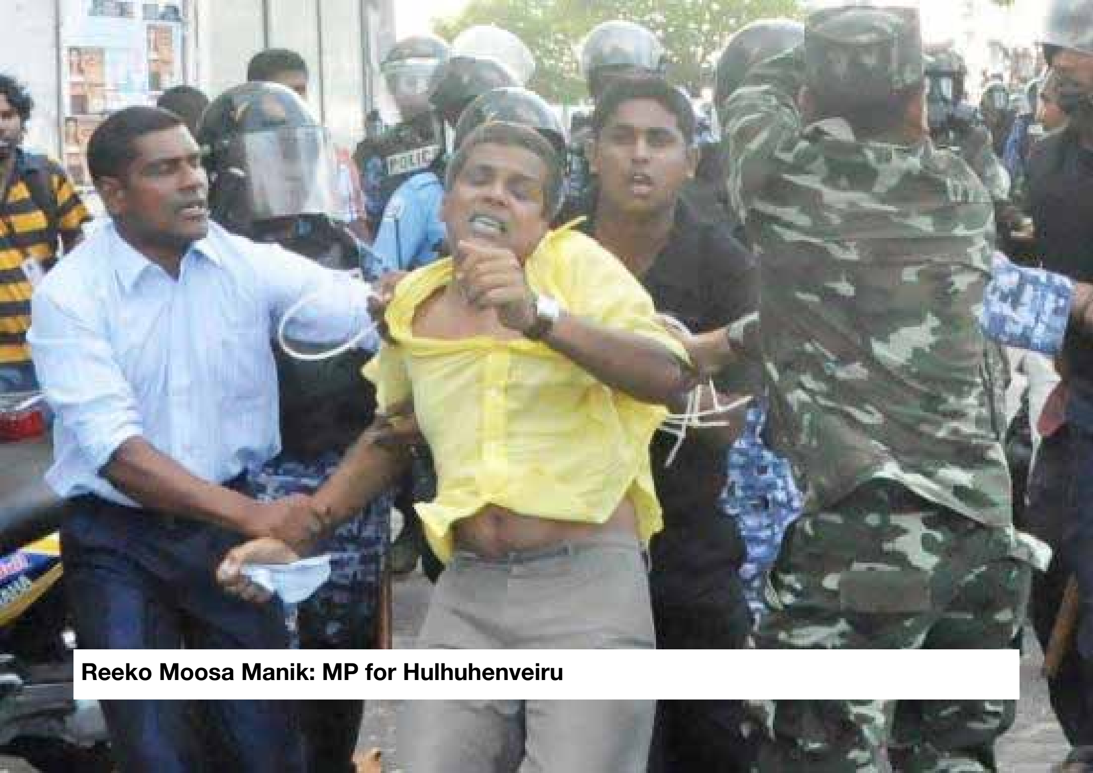
Reeko Moosa Manik: MP for Hulhunenveiru