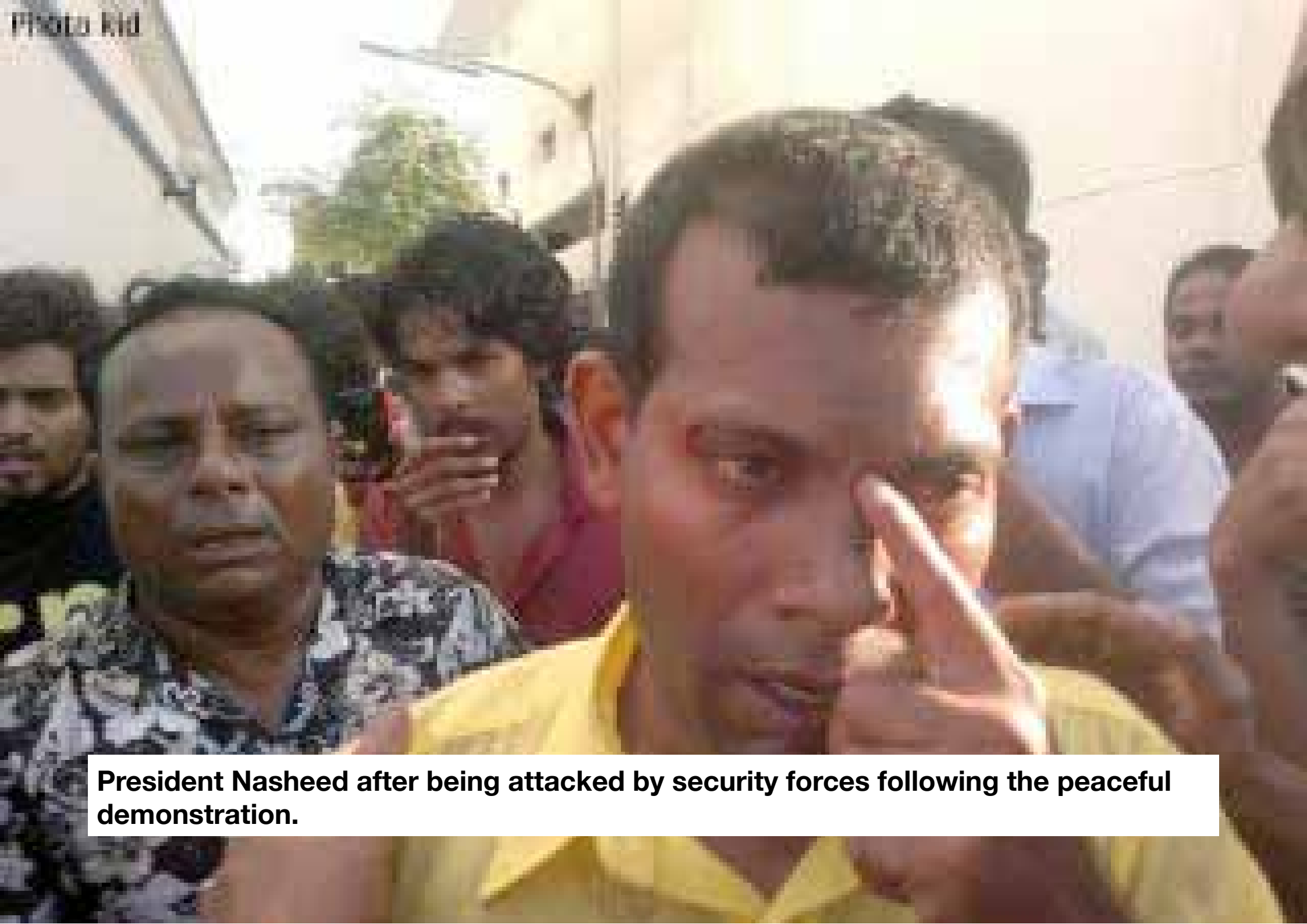
President Nasheed after being attacked by security forces following the peaceful demonstration.