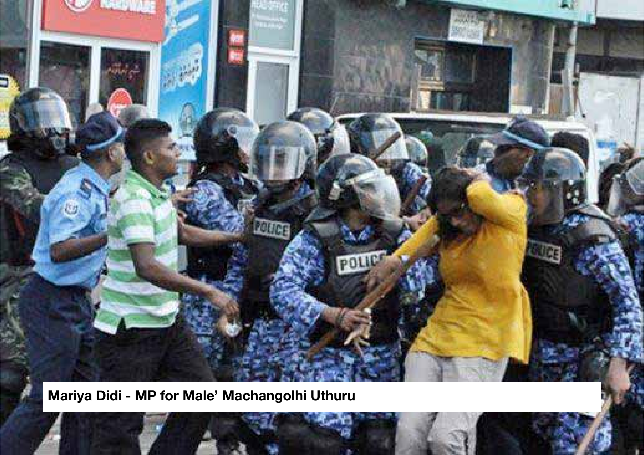
Mariya Didi - MP for Male' Machangolhi Uthuru